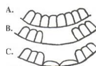
Typical Mouth of Calf at Various Ages

A. Calf has 8 temporary incisors, eligible to show and sell.